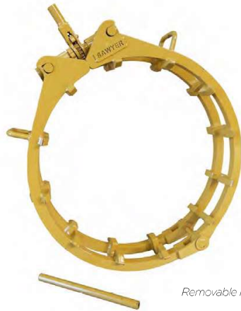
Removable ratchet handle