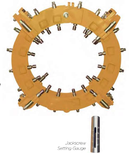
Jackscrew Setting Gauge