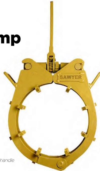
Built-in ratchet handle