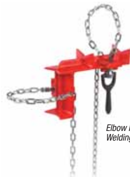
Elbow Pipe Welding Vise