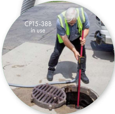
CP15-38B in use