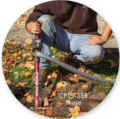
CP15-38B in use