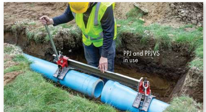
NOTE: PPJVS sold separately from PPJ.