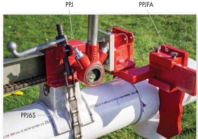
NOTE: Fitting attachment (PPJFA) and saddles sold separately from PPJ.