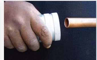
DEB200 external use