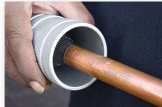
DEB200 internal use