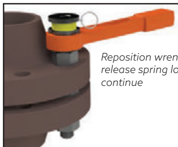
Reposition wrench on nut and release spring loaded plate to continue