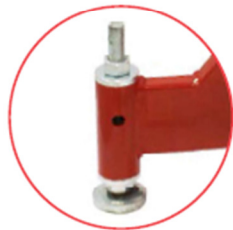
Levelling pads supplied as standard