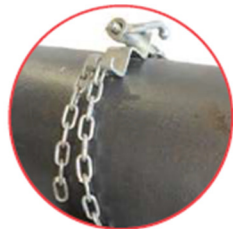
Hold down chain device 3506 locks pipe to jack