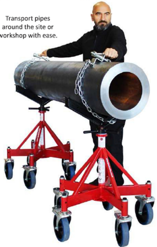
Shown with 3504 caster wheel kit fitted and 3506 hold down chain device

Transport pipes around the site or workshop with ease.