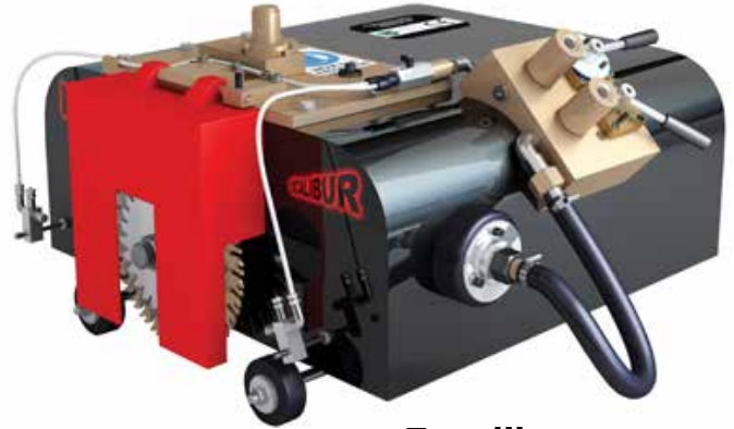
Excalibur Model 210